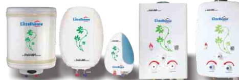
ELECTRIC GEYSERS / GAS GEYSERS