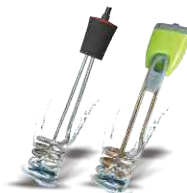
IMMERSION WATER HEATER